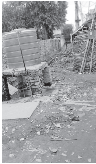
There is no concrete arrangement of water in most of the vulnerable settlements so we

Almost every human being knows about how important water is in our life. But this does not apply to those people who still do not even know the definition of the importance of water in our lives. On this subject, our Lucknow-based Balaknama reporter conducted a meeting with children on the topic of "the importance of water" and tried to know the opinion of the children on this. The children shared that as you also know that there is no such arrangement for any kind of facilities for the street children, which they can take advantage of without worrying.