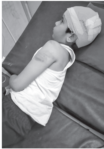
my hands and feet turned blue and I suffered a head injury. I kept apologizing but the school manager did not spare