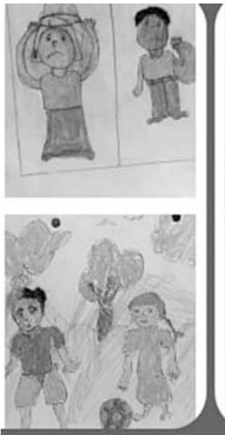
light. Some of these parents build wooden stand, they can