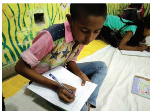
Talkative reporter trying write the news.