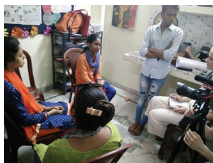
Talkative reporters share their experience with Denmark Media.