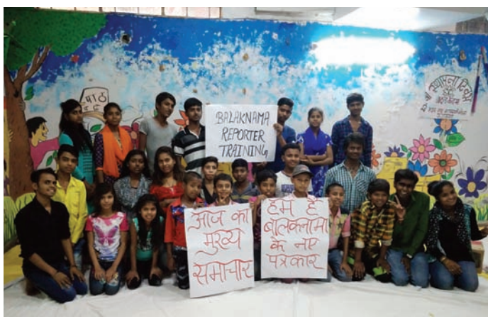
New journalists of Balaknama are happy after training

We are sharing some photos related to these moments with you.