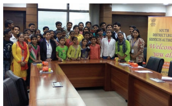
Awareness in the street children about district court proceeding