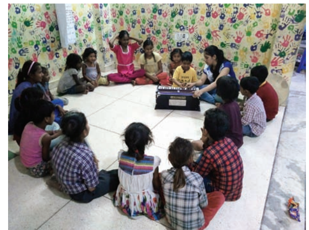
Kids are learning the music.