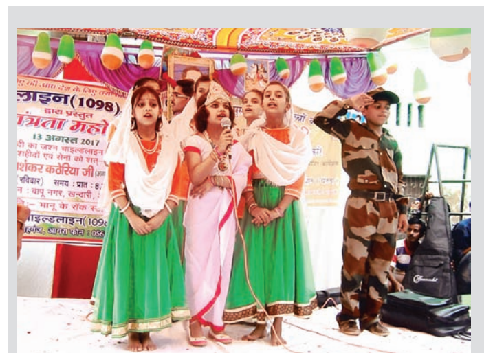
Members of Childline and Badte Kadam celebrating Independence Day

forcefully make us do such things. If I request them to forbid, they run after me for beating me also they complaint continued on pg. 7