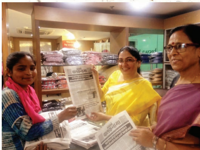
Balaknama's stakeholders taking balaknama