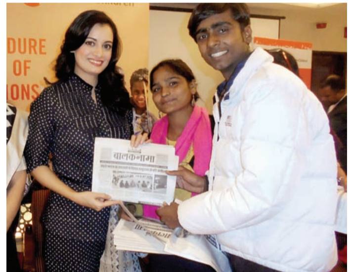
Balakanama Reporter with Actress Dia Mirza