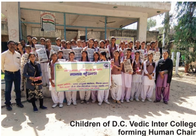
Children of D.C. Vedic Inter College forming Human Chain