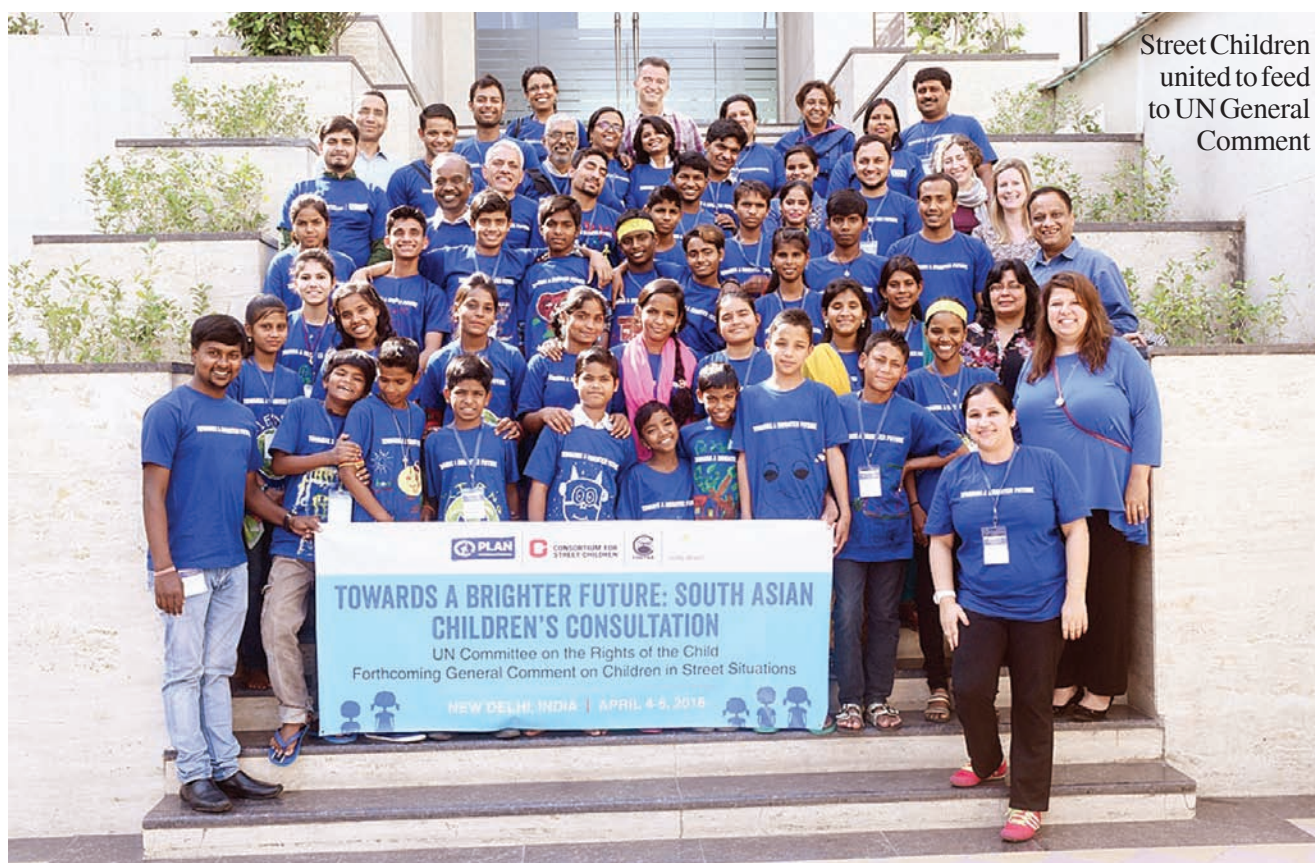
Street Children united to feed to UN General Comment